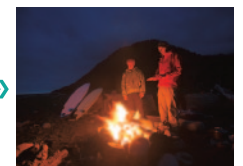
Conventional digital camera